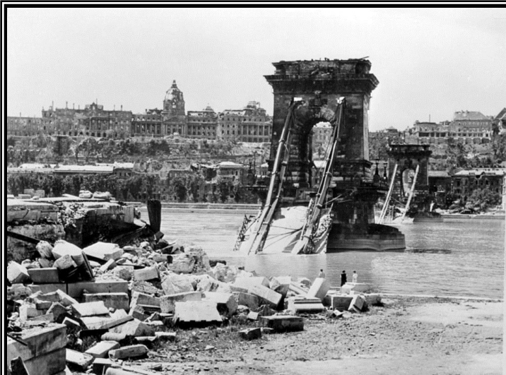
Budapest in the Aftermath of World War II